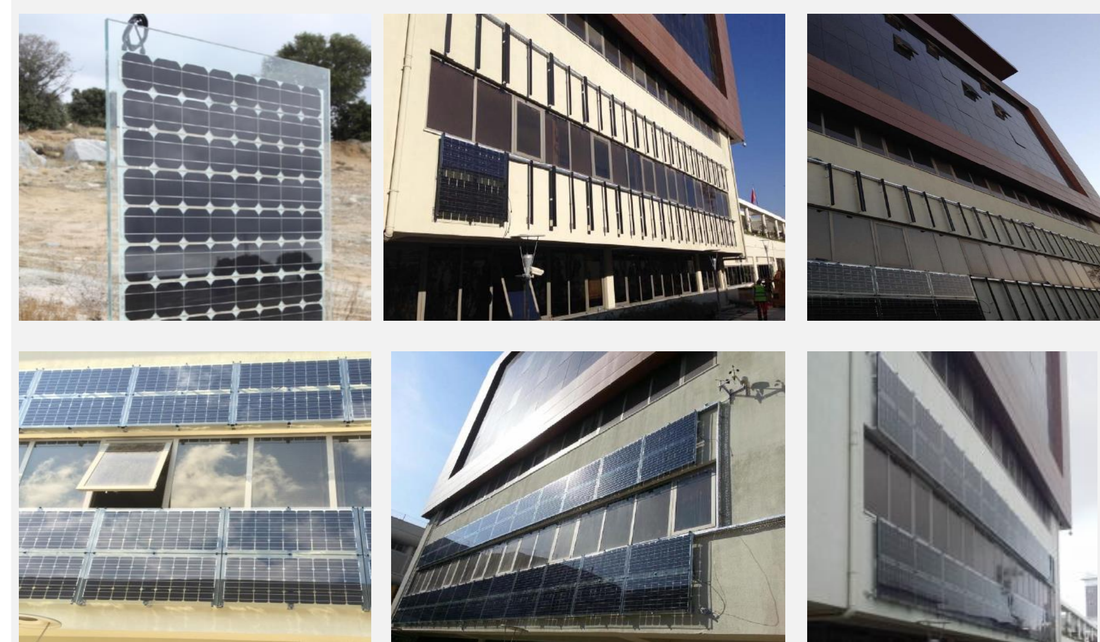
Figure 1. PV modules installation process at Yazar University, Izmir (Turkey).

REELCOOP, an EU-FP7 funded project which stands for REnewable ELelectricity COOPeration ( www.reelcoop.com ), aimed to develop renewable electricity generation technologies and promoted cooperation between EU Partners. Three prototype systems, representative of both micro and large-scale approaches to electricity generation, were developed. One of them was a photovoltaic ventilated façade (6 kW e ), installed at Yazar University (Izmir, Turkey) (Figure 1). The c-Si modules used an innovative glass-glass configuration with high mechanical stability, without the need of an aluminium frame. The installation of the modules followed a novel procedure accomplished within 5 working days, considering façade and all electrical connections.